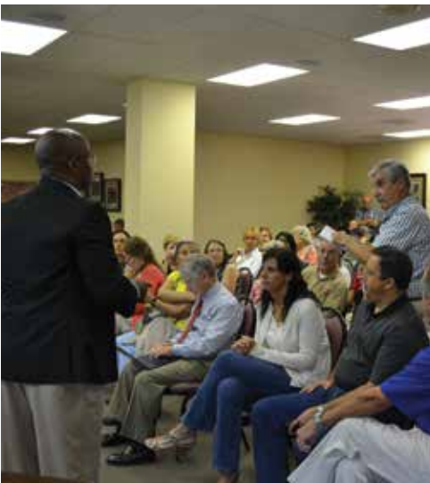
Barnwell County Promise Zone Community Meeting