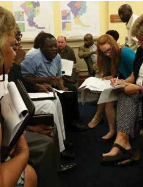
Jasper County Promise Zone Community Meeting