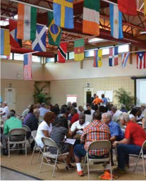
Allendale County Promise Zone Community Meeting

Black added, "There are challenges in our rural communities that need to be addressed, including infrastructure needs, educational challenges, improved workforce training, healthcare delivery, and community and economic development assistance. We will work closely with the USDA and other federal partners to