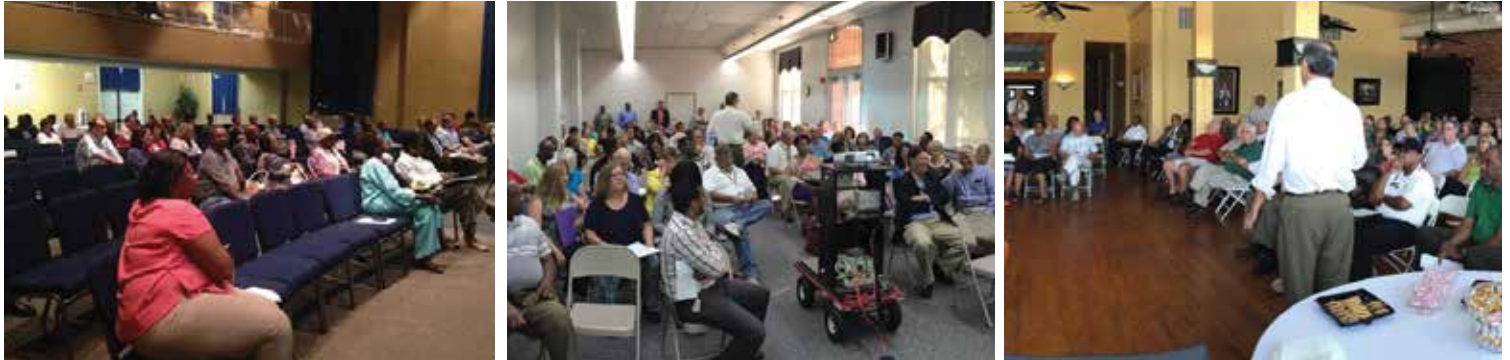
SCA held community listening sessions as part of the Promise Zone strategic planning process in every county. (L-R) Bamberg, Colleton and Hampton County Promise Zone Community Meetings.

For more information, visit the website: www.scpromisezone.org